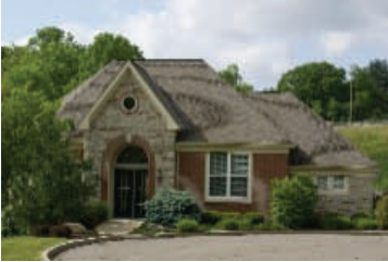
Shadow Lake Times