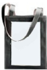
On The Go Tote