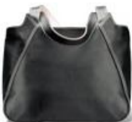
Starter Kit Bag