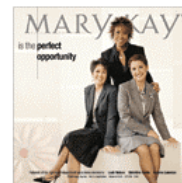
Team Building CD