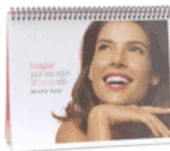
Skin Care Class Flip Chart