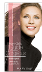
Girl's Guide to Getting Gorgeous Customer Brochure