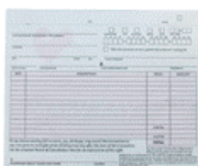
Sales Tickets, pk./25