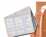
Satin Hands® Pampering Set Samplers, 12 sets

Please contact your Beauty Consultant or go online to www.marykay.com & click "Sell Mary Kay" for more information.