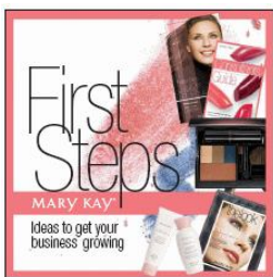
First Steps: Ideas to Get Your Business Growing Brochure

Your Starter Kit Comes With Over $155!! in Business Tools.