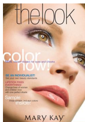
The Look, pk./10