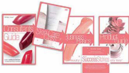
Consultants Guide, Skin Care Class Guide, Business Basics Workbook, Product Guide & Success Stories CD