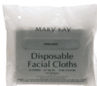
Disposable Facial Cloths, pk./30