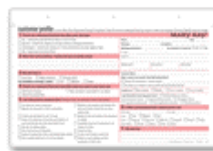
Customers Profiles, pk./50