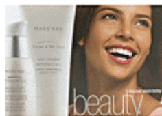
Beauty Books, 3 pk./10