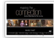
Making the Connection DVD