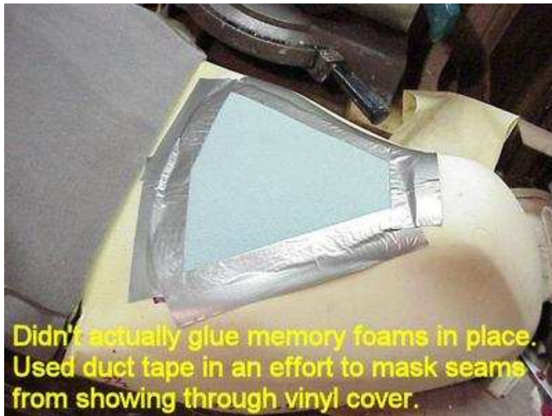
Didn't actually glue memory foams in place. Used duct tape in an effort to mask seams from showing through vinyl cover.