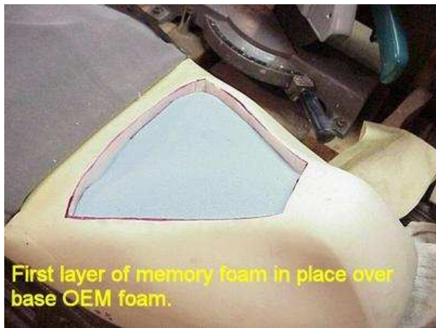
First layer of memory foam in place over base OEM foam.