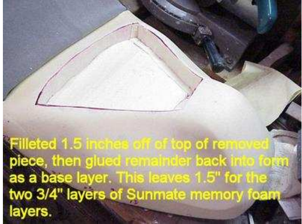
Filletted 1.5 inches off of top of removed piece, then glued remainder back into form as a base layer. This leaves 1.5" for the two 3/4" layers of Sunmate memory foam layers.