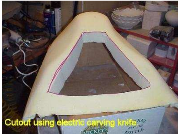
Cutout using electric carving knife