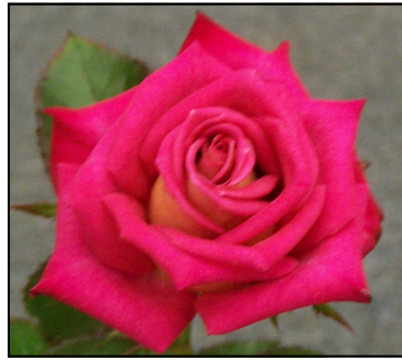
Miniflora Queen-'Edisto' Thorpe