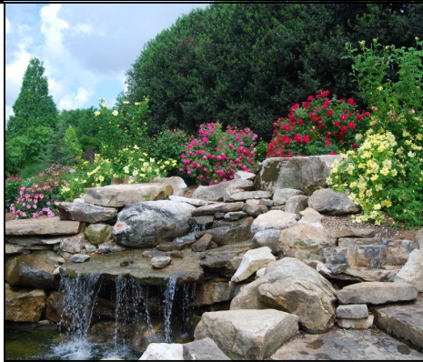
Beall Family Rose Garden

During the event, the Tennessee Rose Society raised funds for the American Rose Society by selling Rose Gardening , a new book from Better Homes and Gardens Maga-