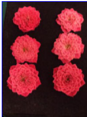
Mini English Box - 'Mariotta'- Hext