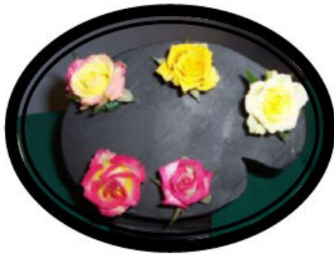
Mini-Artist Palette - Baird