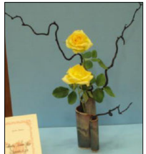
Oriental Freestyle Duke Award and Silver Certifi- cate 'St. Patrick' -