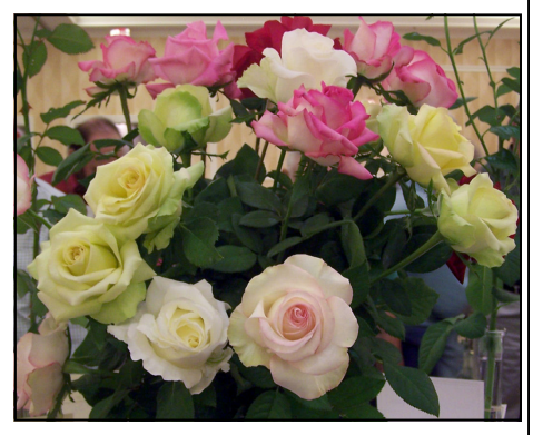
Large Rose Tin Can- Brickman