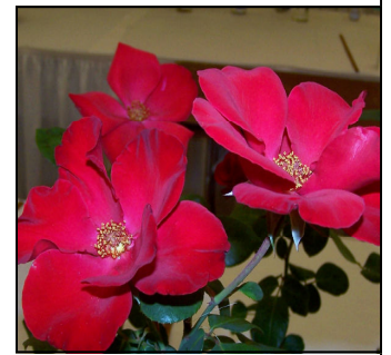
Large Flowered Climber- 'Altissimo'- Bates