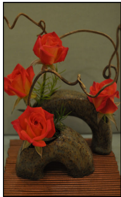
Oriental Free Style 'Hot Tamale' - Paula Williams