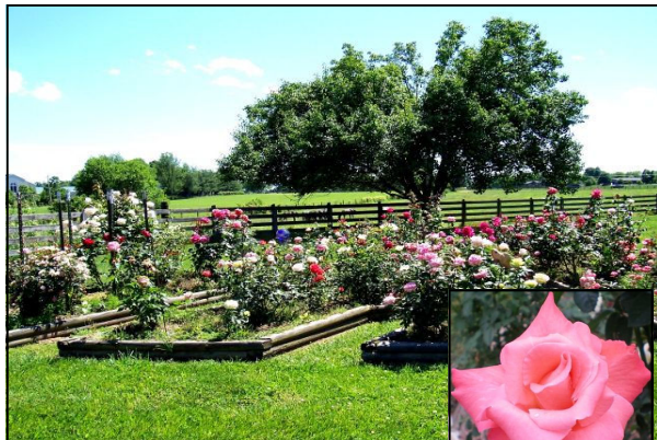
'Touch of Class'