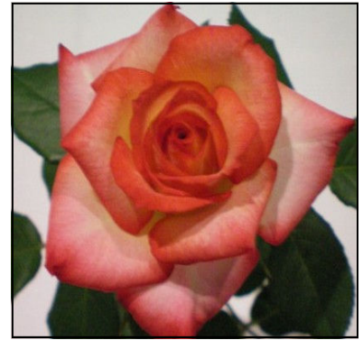
Miniature Queen 'Best of 04' Lavonne Glover