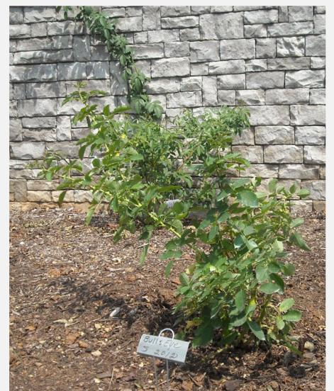
Newly planted Carefree Spirit (left) and Bulls Eye (right).

him at the National Mini Rose Show and Convention in Columbus, Ohio.