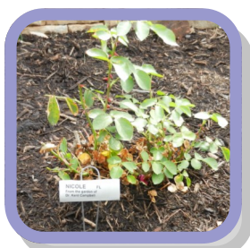
BGRS Public Garden Photos April 22 By M. Hext