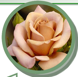
Sugar Moon—Hybrid Tea