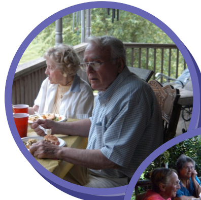
BGRS Potluck June 11