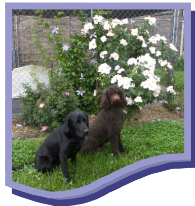
Caution: Dogs love this tea!

This tonic can be safely applied to your roses a couple of times each year about 6-weeks apart. Your roses should have darker leaves, deeper-colored blooms, and healthy new growth in a week or two. I can see a noticeable difference after each application. Make some alfalfa tea; your roses will love you for it!