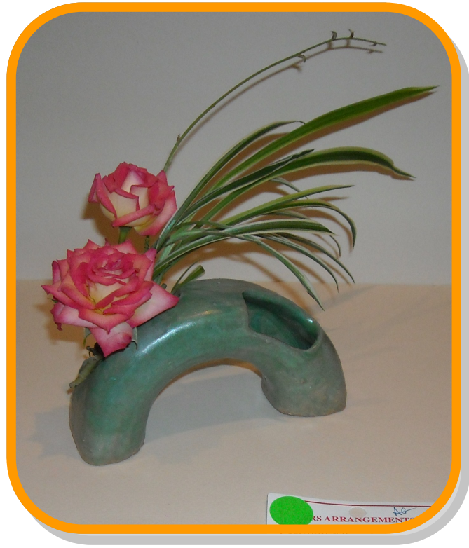
Ann—Mini Oriental Free Form Soroptimist International