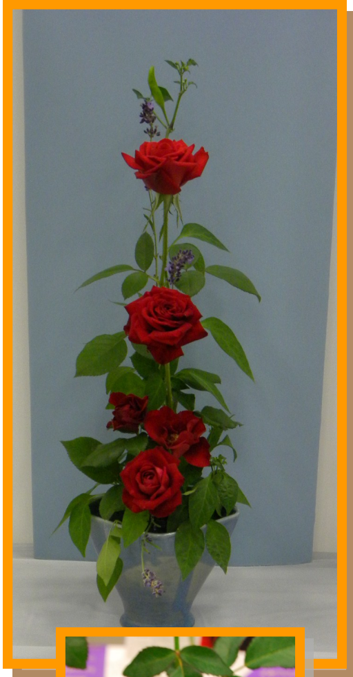
Ann—line mass Glad Tidings