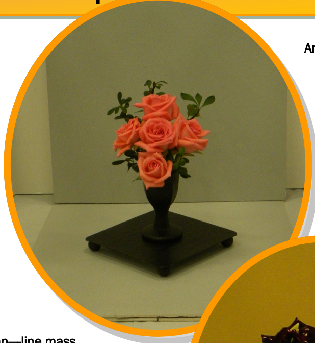
Ann—mini line mass Pierinne