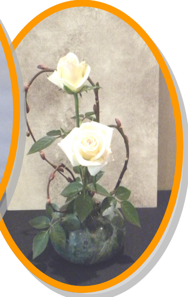
Mary Ann Mini Oriental Free Form Butter Cream