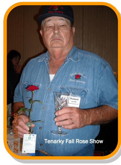
Tenarky Fall Rose Show