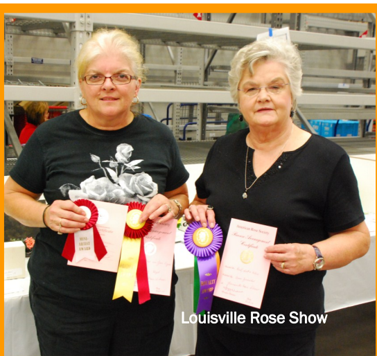
Louisville Rose Show